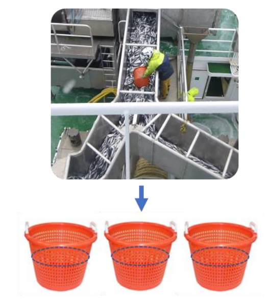
3 x 1/2 baskets (giving approx. 40-45kg)