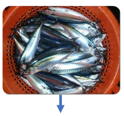
For every fish in the basket, measure and record length to lowest cm, then weight in grams